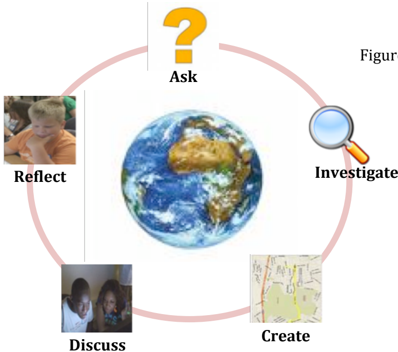
Figure 1: Inquiry-based geospatial learning